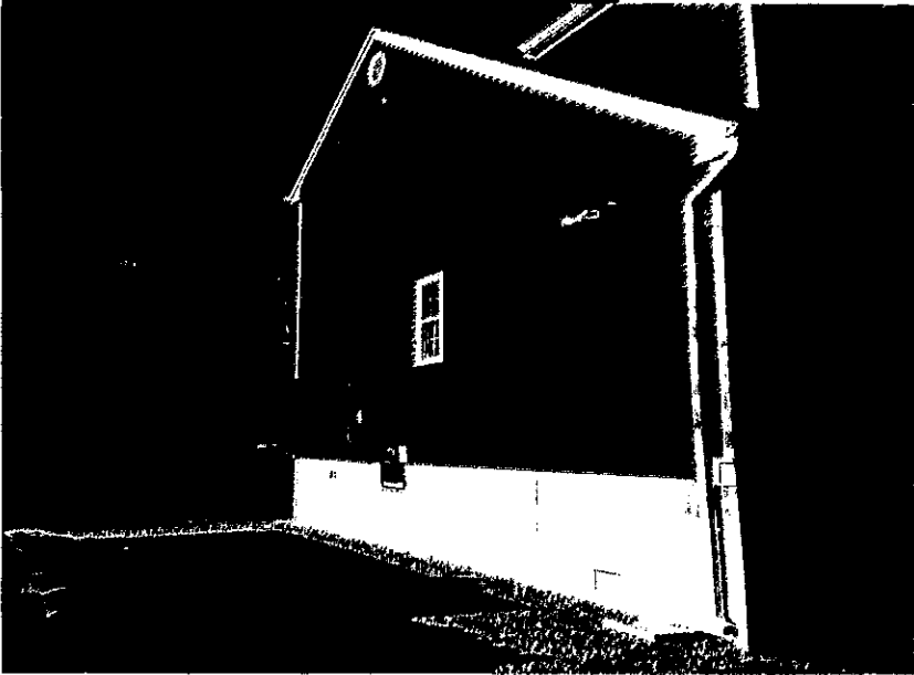
FLOOD VENT – (TAKEN 10/21/15)