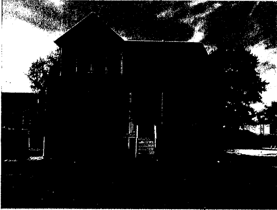
REAR VIEW – (TAKEN 10/21/15)