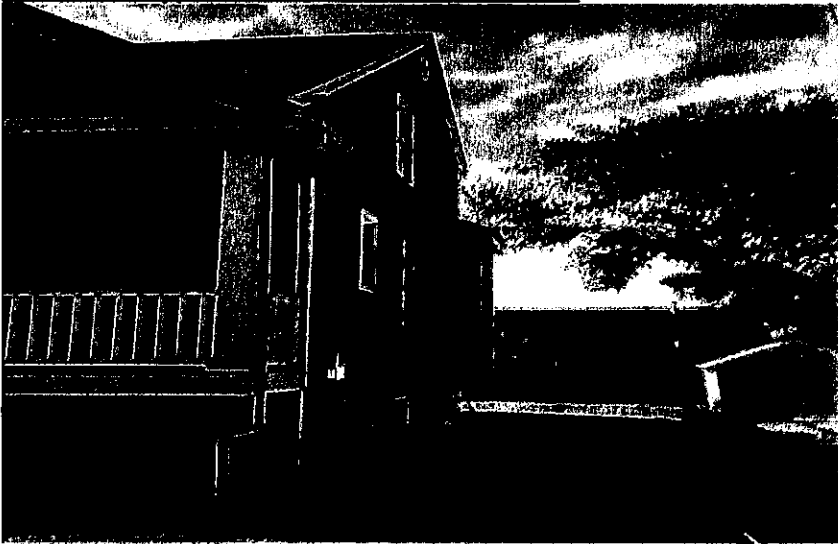
LEFT SIDE VIEW – (TAKEN 10/21/15)